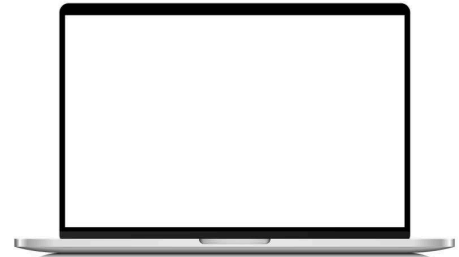
2024 Fall Crop Protection Webinar Series

Sign up now for a popular webinar series that addresses timely topics regarding integrated pest management for field crops. University of Kentucky Martin-Gatton College of Agriculture, Food and Environment extension specialists have once again organized the Fall Crop Protection Webinar Series, hosted through the Southern Integrated Pest Management Center. Each webinar will begin at 10 a.m. ET/9 a.m. CT, and will be one hour in length. Continuing education credits for Certified Crop Advisors include 4 CEUs for IPM (1 CEU for each webinar). Kentucky pesticide applicators will receive 4 CEUs (1 CEU for each webinar) for Category 1a (Agricultural Plant).